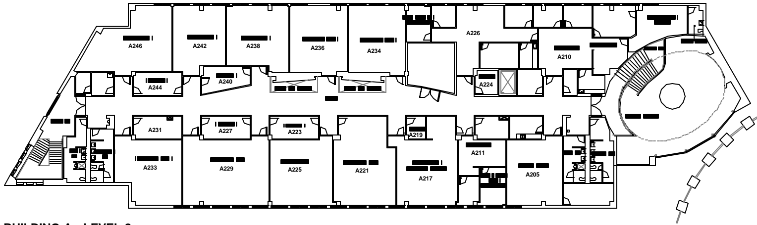
BUILDING A - LEVEL 2